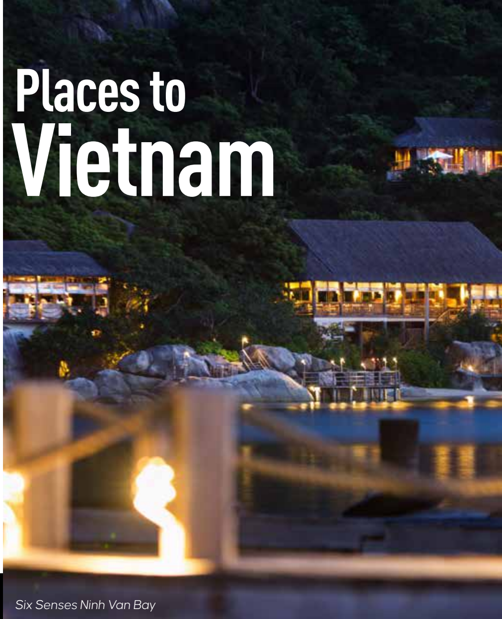
Six Senses Ninh Van Bay

Vietnam offers an excellent selection of accommodations that cater specifically to the needs of the discerning corporate traveler. In this article, we unveil a curated collection of exceptional hotels, where business and leisure converge in some of Vietnam's most unforgettable destinations.