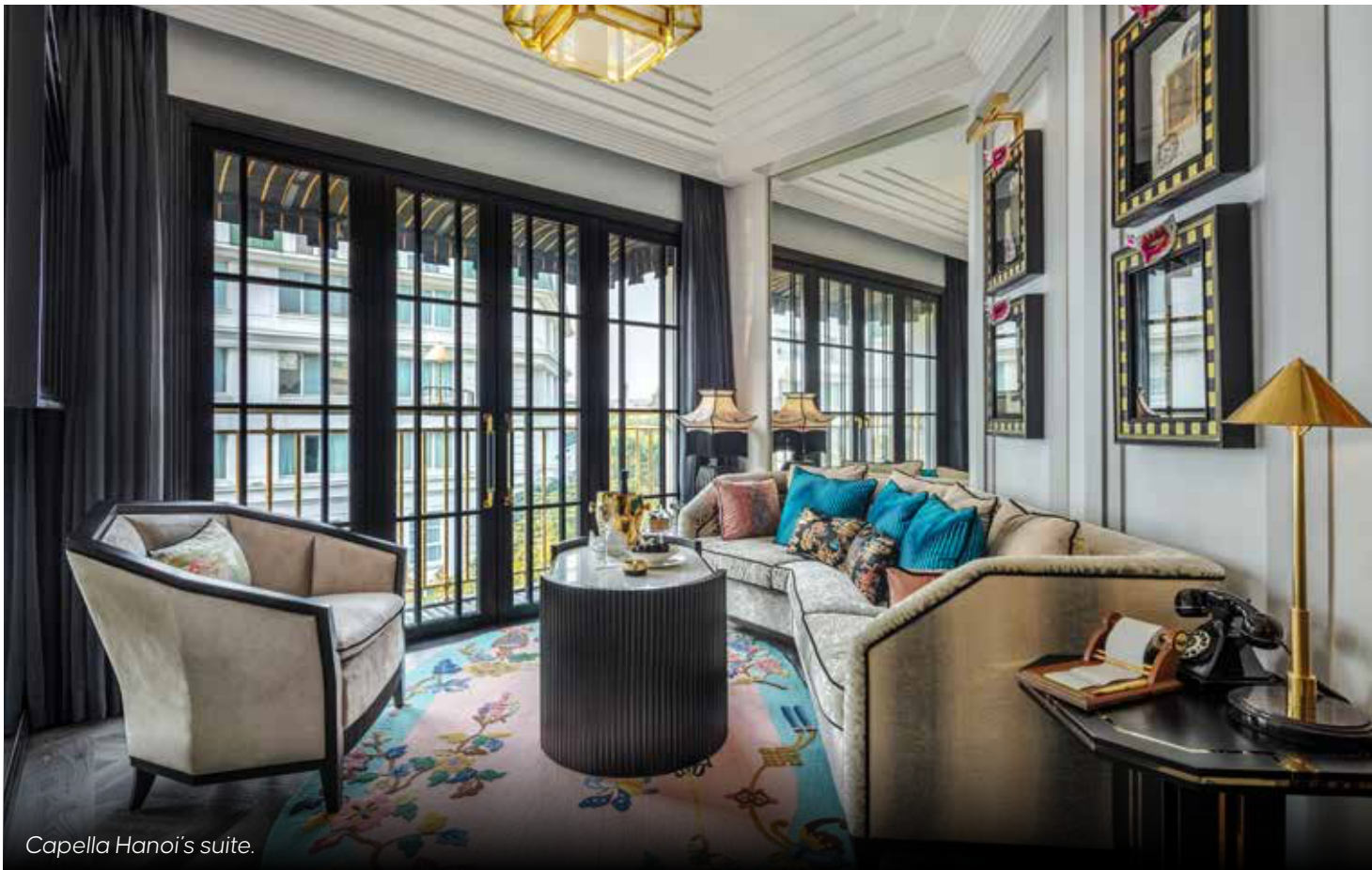
Capella Hanoi's suite.