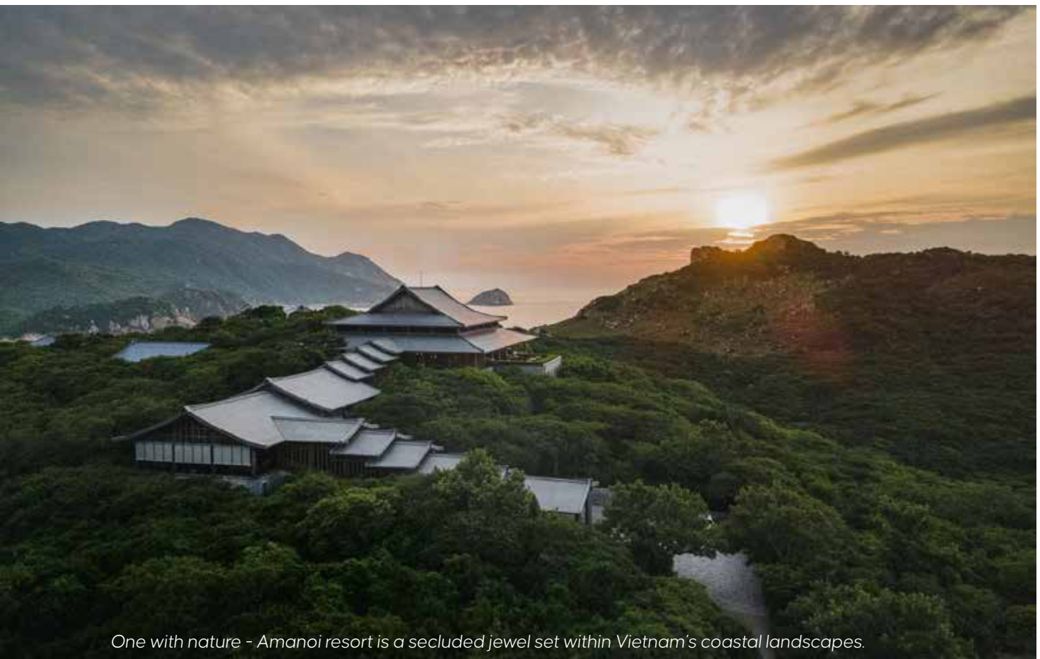
One with nature - Amanoi resort is a secluded jewel set within Vietnam's coastal landscapes.