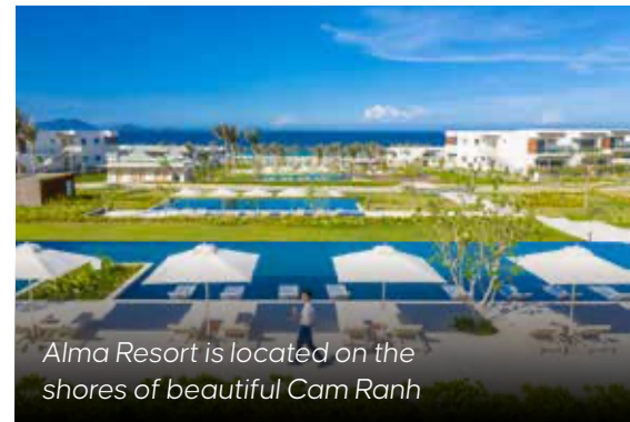
Alma Resort is located on the shores of beautiful Cam Ranh

specifically tailored to children's enjoyment. When it comes to dining, the choices are abundant, ranging from quiet seaside meals to sumptuous buffets and even an Italian restaurant. Starting the day at Alma Resort is particularly a delight. The breakfast buffet is nothing short of extraordinary, featuring an unbelievable array of food offerings. Whether indulging in the resort's activities, savoring the culinary delights, or simply basking in the picturesque surroundings, Alma Resort ensures a memorable stay that leaves travelers feeling refreshed and rejuvenated.