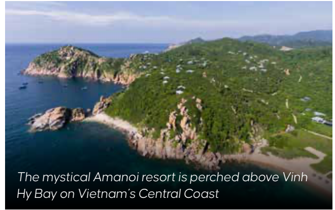
The mystical Amanoi resort is perched above Vinh Hy Bay on Vietnam's Central Coast