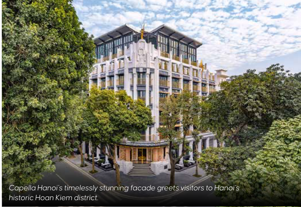
Capella Hanoi's timelessly stunning facade greets visitors to Hanoi's historic Hoan Kiem district.

Situated by Hoan Kiem Lake, Capella Hanoi is an Art Nouveau masterpiece inspired by opera artists, designers, and composers. Its 47 rooms and suites, adorned with operatic memorabilia, pay homage to legendary artists and performances. A dedicated Capella Curator is available to unveil the intricacies of Vietnam's culture to guests. Just moments from the Hanoi Opera House and the Old Quarter, each space reflects the essence of the Jazz Age, with elegant wrought-iron French balconies framing lush green views.