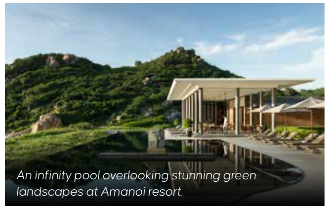
An infinity pool overlooking stunning green landscapes at Amanoi resort.