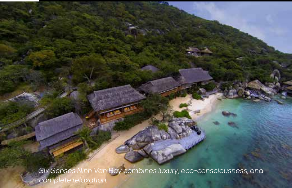
Six Senses Ninh Van Bay combines luxury, eco-consciousness, and complete relaxation.